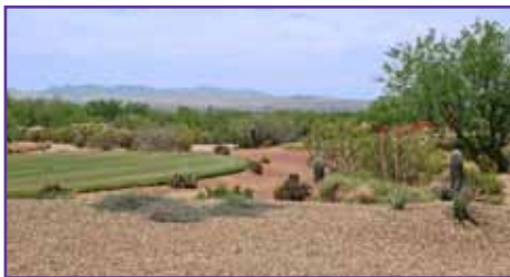
Best backyard view at Quail Creek