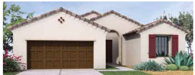
DESIGNER HOME - Estimated Completion 12/10