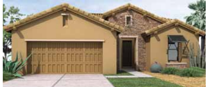
DESIGNER HOME - Estimated Completion 11/10