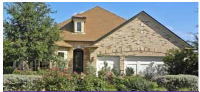
MODEL HOME FOR SALE