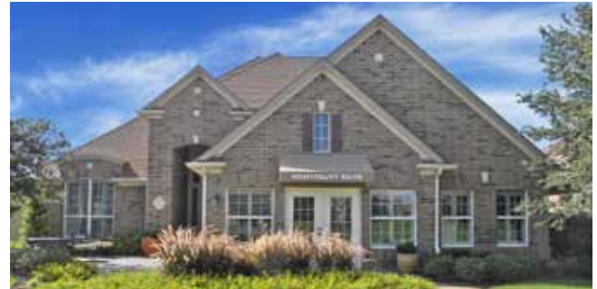
MODEL HOME FOR SALE