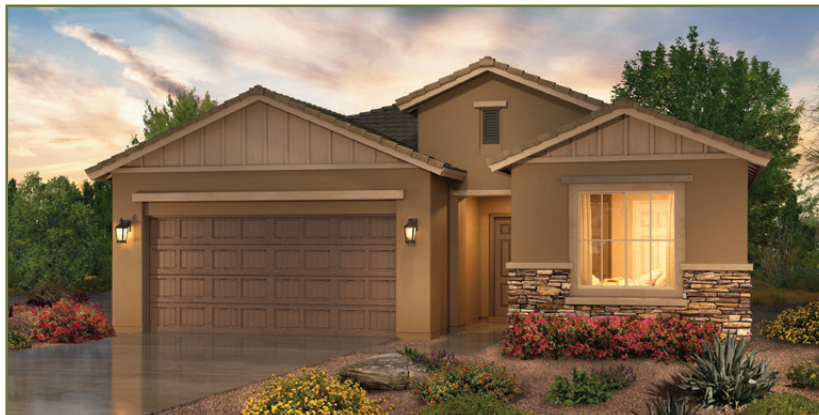
Exterior Design B