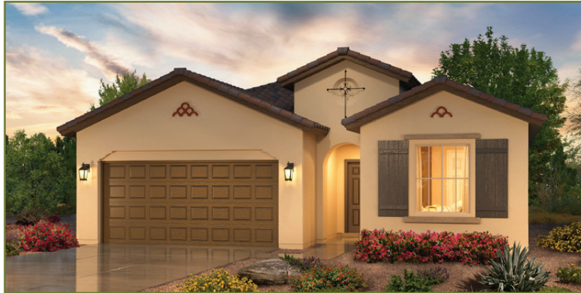
Exterior Design A