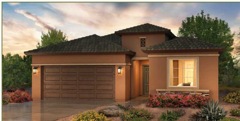
Exterior Design C