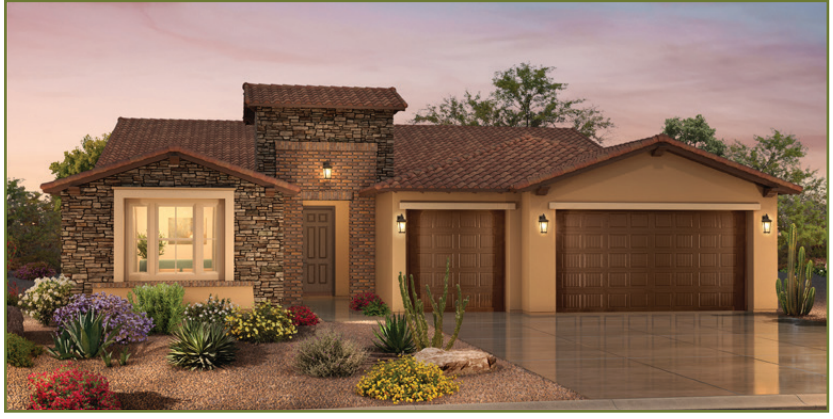
Exterior Design C