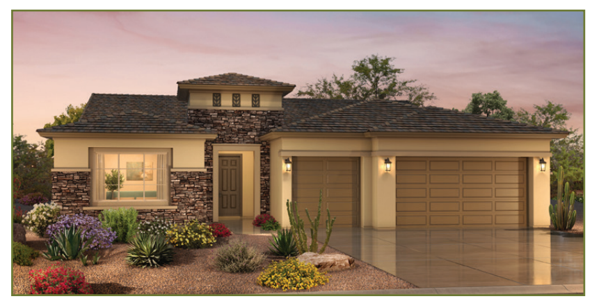
Exterior Design D

2021 MAME Award Winner Home Builders Association of Central Arizona