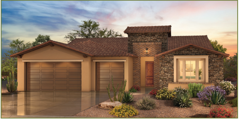
Exterior Design C