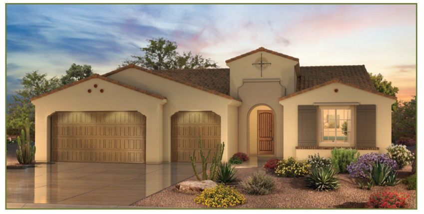
Exterior Design A