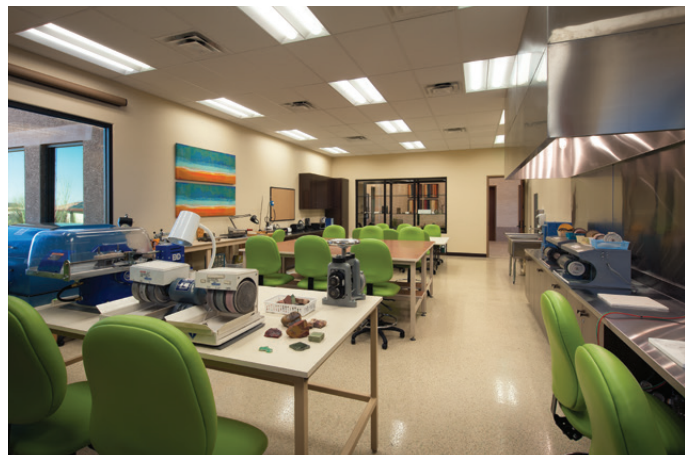
Images shown above are from Quail Creek's Creative Arts Center. Interior design, equipment, furnishings and other interior details will vary for the Creative Arts Center at SaddleBrooke Ranch.